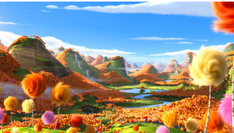
The town of Thneedville.

We can sometimes relate to Once-ler because we don't tend to think of the