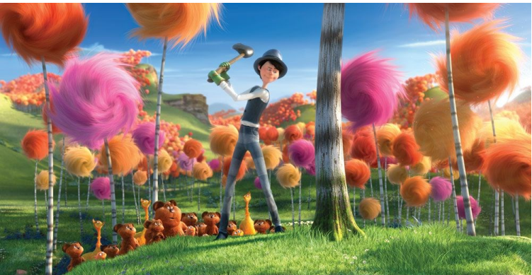
The Once-ler about to cut a Thneed.

consequences first before doing the action which leads us to regret at the end.