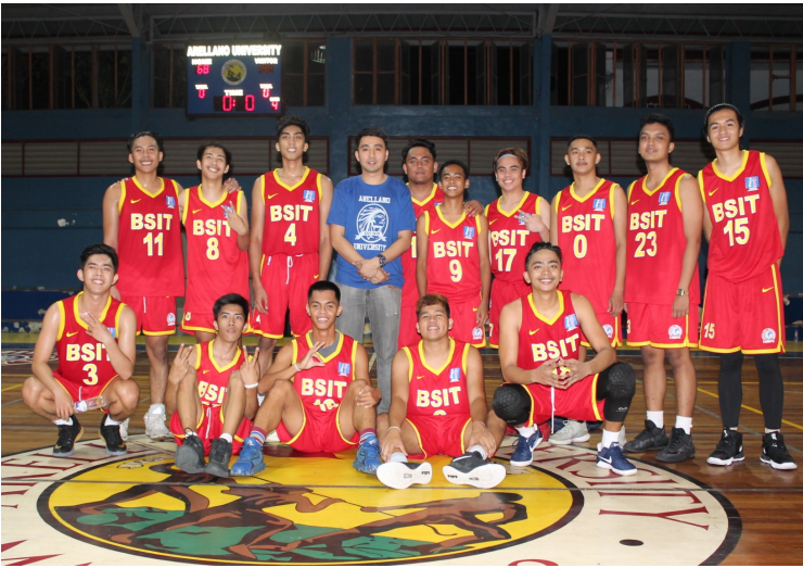
The Champion: The I.T Department