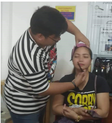
Makeup is demonstrated on a mother.

The professional makeup artists that were invited took turns to demonstrate artistically how an ordinary work day makeup would differ from special events, which made the entire event successful.