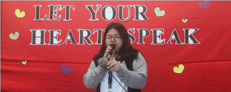
SHS students participate in open mic.

college. The event encouraged everyone to perform or share through an open mic and thus, the participants presented spoken poetry, confessions, speeches and shout outs. The event was a huge opportunity for students to let their emotions and creativity be free. Some from the audience even gave their own advice to some students.