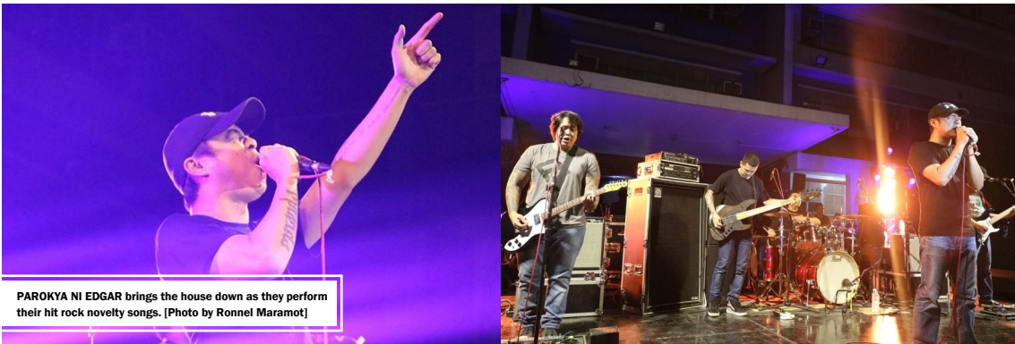
PAROKYA NI EDGAR brings the house down as they perform their hit rock novelty songs.

Rock icon Parokya ni Edgar brought the house down as they performed their novelty songs for Arellano University's Foundation Concert last February 19, 2019 at Jose Abad Santos Campus' Quadrangle.