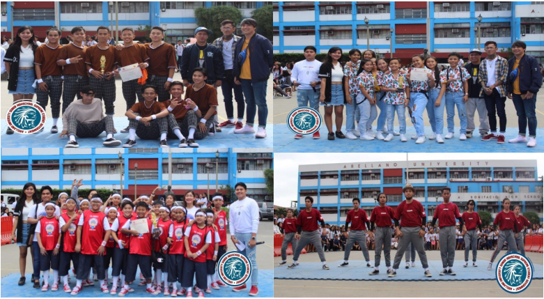
TOP: AU-Jose Rizal Campus BOTTOM LEFT TO RIGHT: Chiefs Dance Company and Unknown 2.0

It was surely a night of memories that as long as music is going on, will always be remembered.