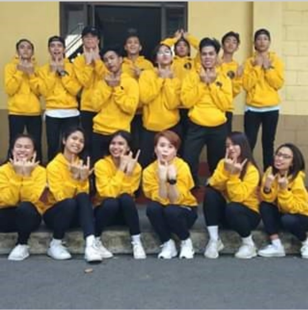
AUPDA at Foundation Day of Don Bosco Mandaluyong

Whenever luck was not in their side, they still continue to practice and be the best. Struggles always come; they have encountered many hindrances just to perform at an event. Problems may come and go, but their adviser sheds some helping hand so that the flames of their passion will still continue. Their passion will always strive on until to their college level, it's their comfort zone and a safe zone.