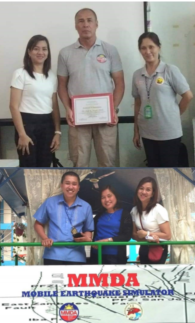
Awarding of Certificate and Experiencing the Earthquake Simulator

It was indeed a meaningful seminar for the all of the students. More events and seminars like this will come to the students of AU-PC.