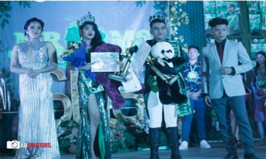
Mr. and Ms. SHS 2019 between their predecessors