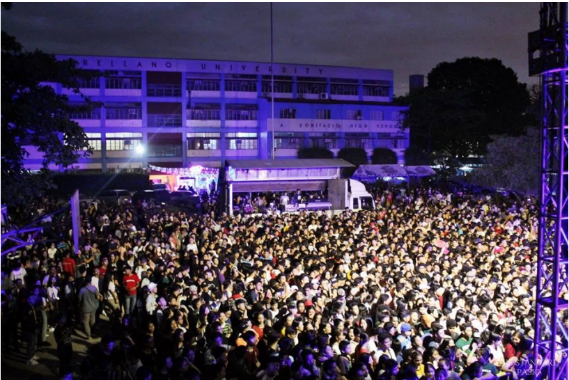
The AU-AB Community rocking out at the 81st Foundation Week concert.