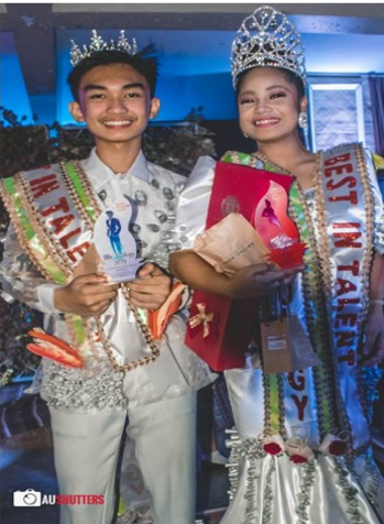
Mr. and Ms. Ecology 2019