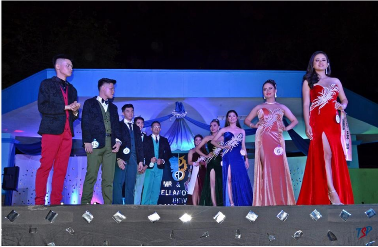
Top 5 Mr. and Ms. Arellano University-Pasig 2019