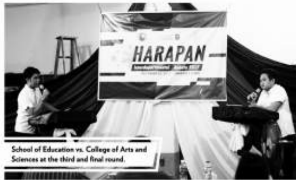
School of Education vs. College of Arts and Sciences at the third and final round.