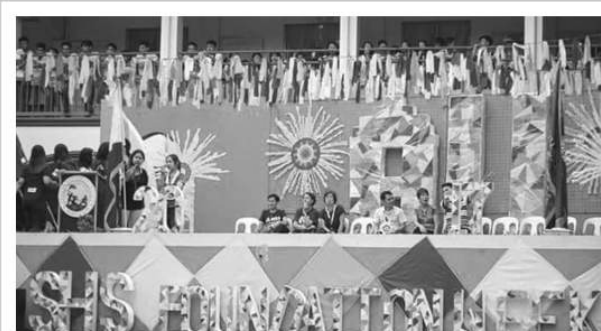
Foundation Day 2017 at AU-JRHS