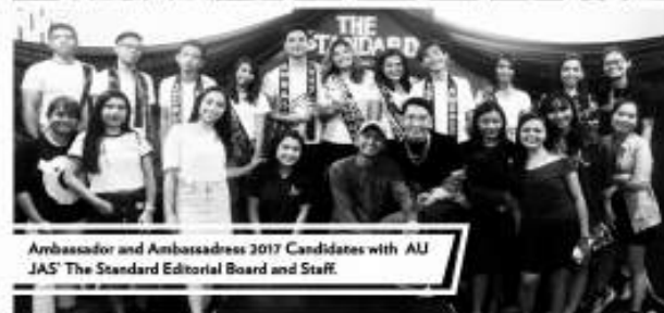
Ambassador and Ambassadors 2017 Candidates with AU JAS' The Standard Editorial Board and Staff.